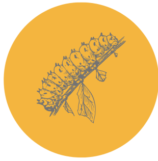
THE UNFOLDING ENNEAGRAM

"Form" is the story and collection of many stories we carry in service to our sense of self.